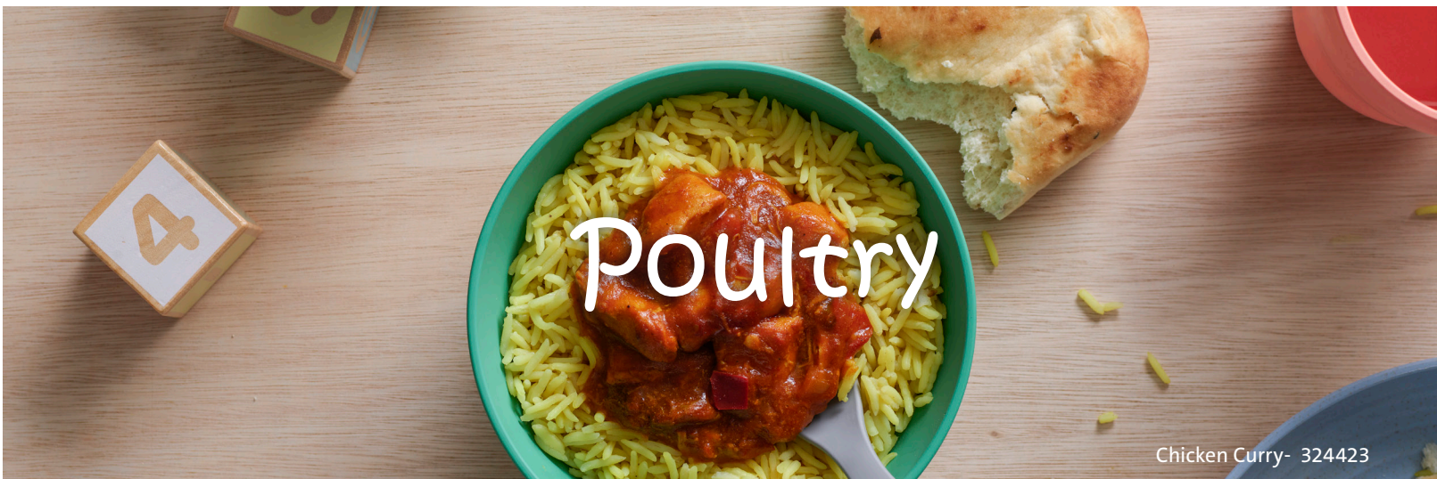
Chicken Curry- 324423