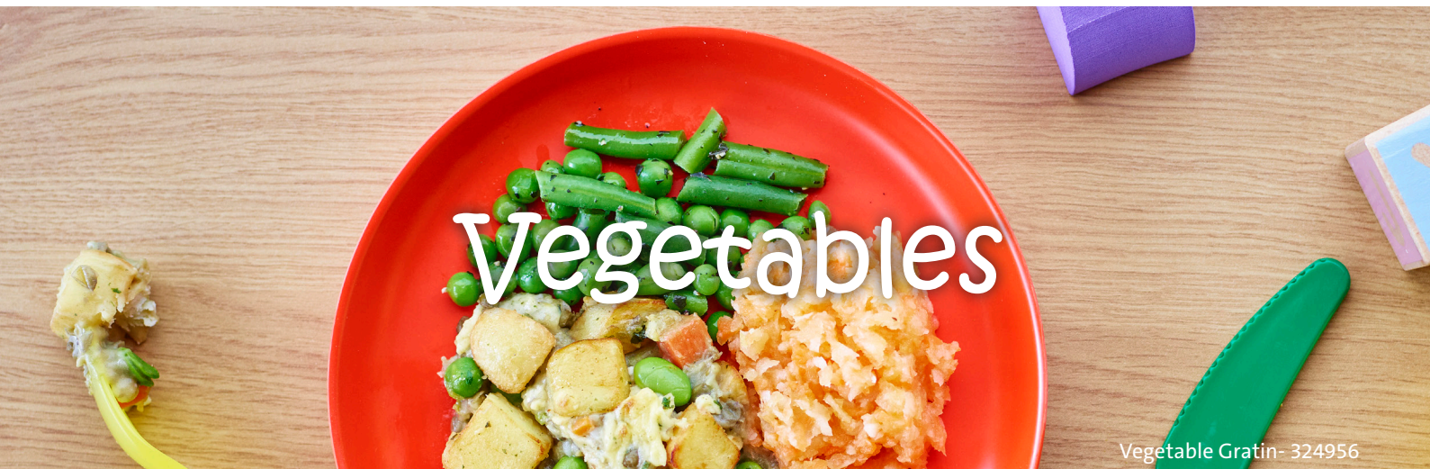
Vegetable Gratin- 324956