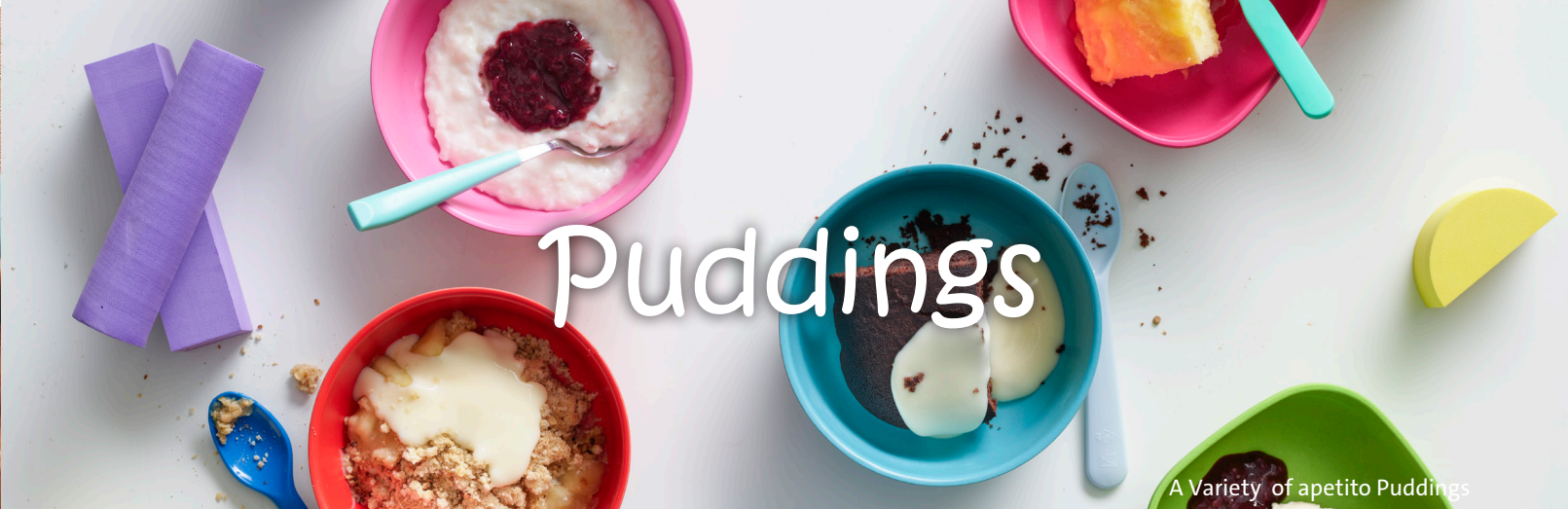
A Variety of apeto Puddings