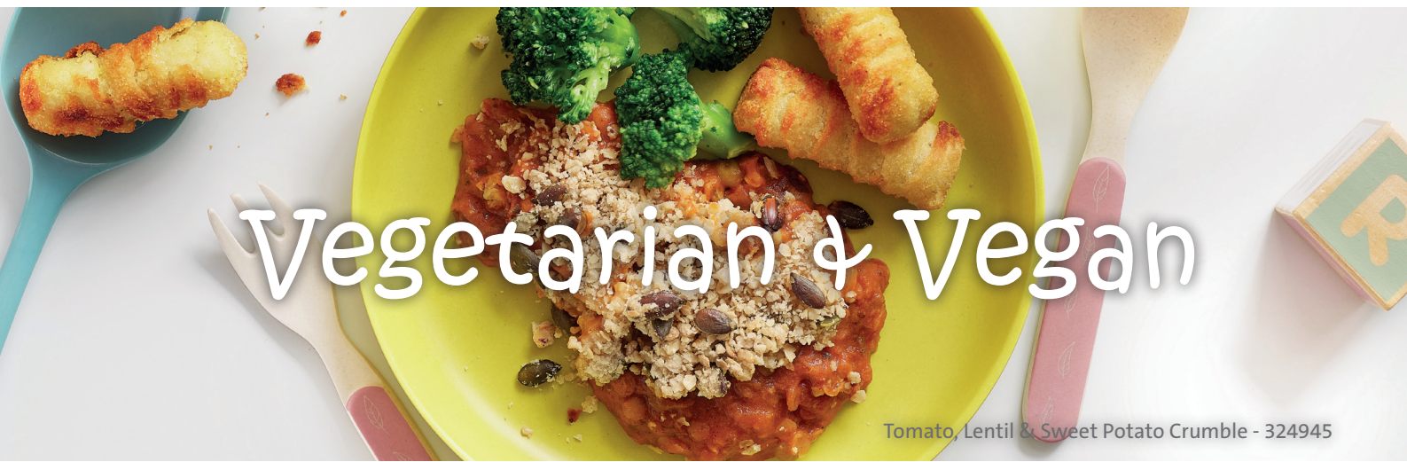
Tomato, Lentil & Sweet Potato Crumble - 324945