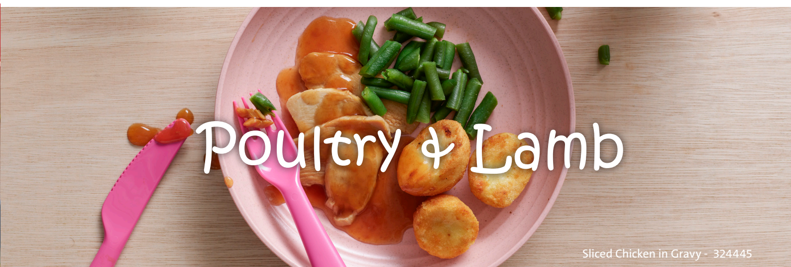
Sliced Chicken in Gravy - 324445